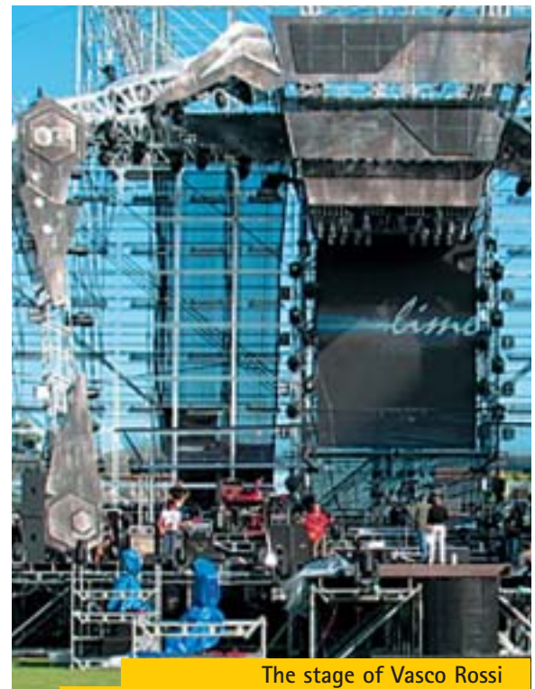
The stage of Vasco Rossi

In his currish ironical song texts Vasco Rossi stands up for the lower class of the society: “My voice is the voice of those who do not have one. That’s why so many people like my music.” Although he is not that much famous abroad than Eros Ramazzotti he could sell his album very well and is meant to be a superstar.